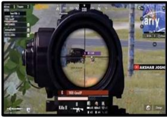
Students playing online PUBG