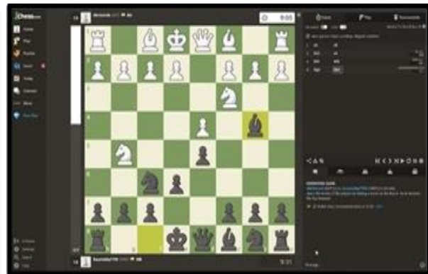
Students playing online Chess