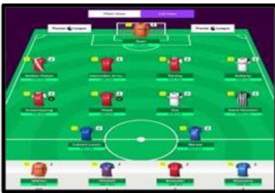
Students playing online football