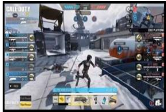
Students playing online Call for duty